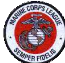
Marine Corps League